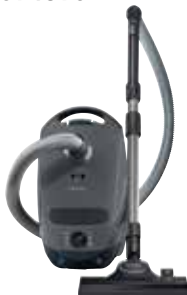
Classic C1 11694890