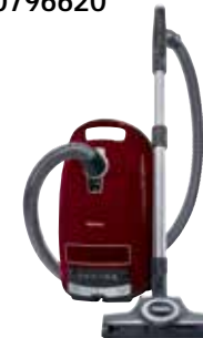
Complete C3 Cat & Dog 10796620