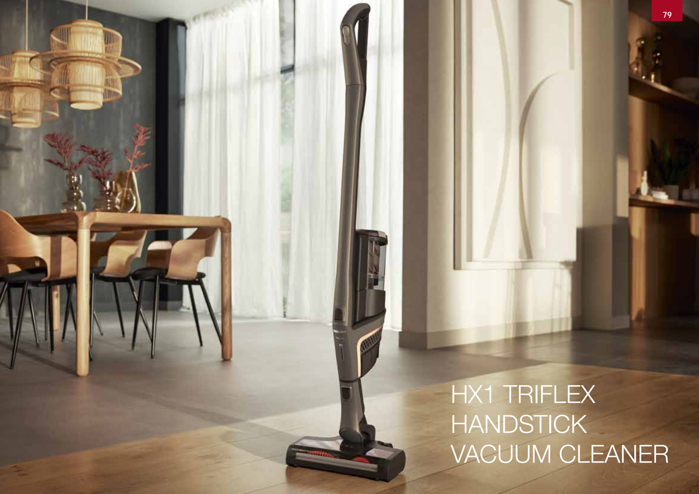
HX1 TRIFLEX HANDSTICK VACUUM CLEANER