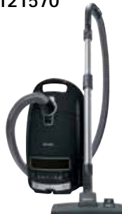
Complete C3 11121570