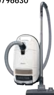
Complete C3 Allergy 10796630