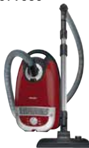
Complete C2 12079050